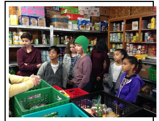
And a little later in the morning for our Junior Youth

An early Saturday morning start for our Senior Youth! Our Senior Youth will also be volunteering at the Regeneration Easter Dinner.