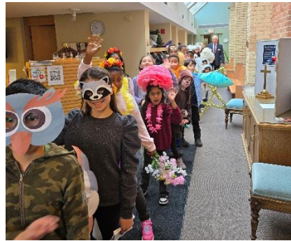
Dec | Mustering for Children's Pageant

AND there was so much more: World Day of Prayer, Coldest Night of the Year, International Christian Voice Gala, Lenten Study “How to Pray”, Holy Week & Easter, Kitchen “Re-Do”, Potlucks, Food Drives, Coffee Hours, Audio Visual Upgrades, Easter & Advent Children’s Choir, Pumpkin Party, “Roaming Shepherds”, Georgetown Bach Chorale, Fall Study “Lord, Teach Us Your Prayer”, Advent Children’s Party, Advenio, Advent & Christmas, Caring & Sharing...we simply cannot name all the wonderful ministry, outreach and fellowship we experienced among our Non-DNA family.