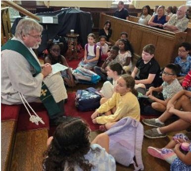
Sep | Blessing of Backpacks