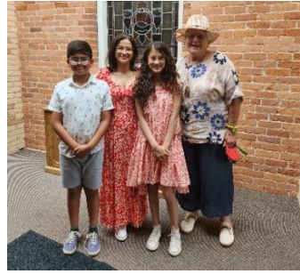
Aug | Summer Greeting