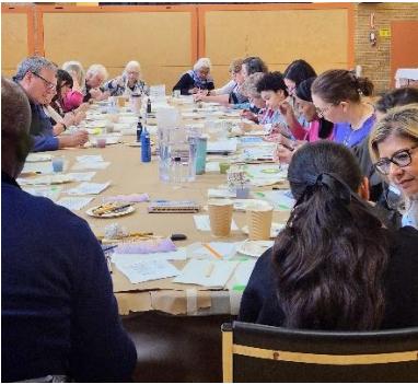
Mar | Lenten Retreat