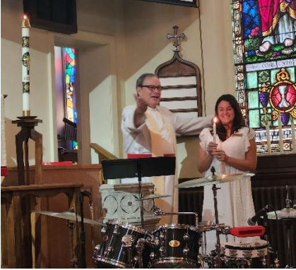
Jan | Starting the New Year with a Baptism

www.christchurchbrampton.ca/recent-events