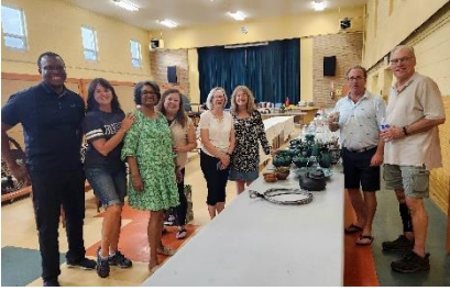
Jul | Prepping for Treasure Sale